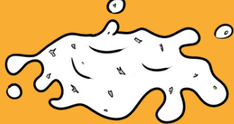
4 Chipotle Mayo