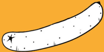
5 Big Al's Gourmet Pork Hot Dog