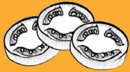
1 Pickled Jalapenos