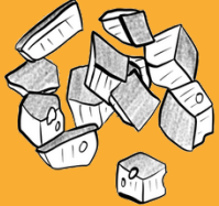
2 Diced Red Onions