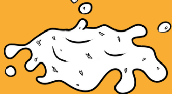
4 Cheese Sauce