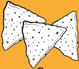
3 Crushed Nacho Chips